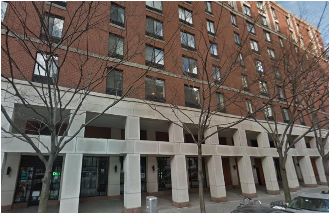
Existing Retail Arcades