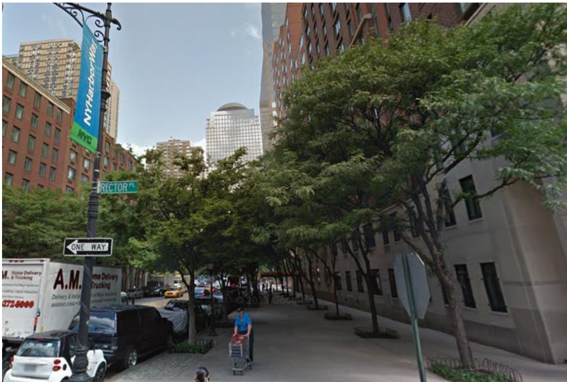
Easterly side of South End Avenue