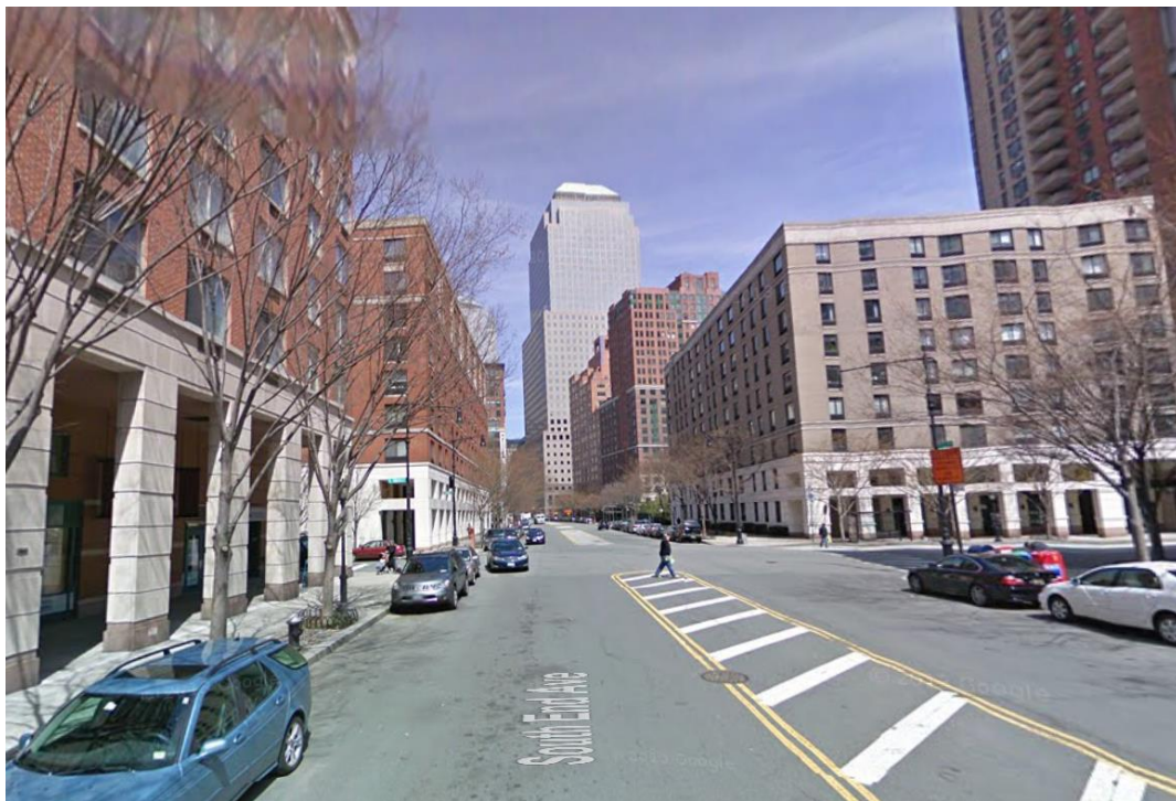
South End Avenue (facing north)