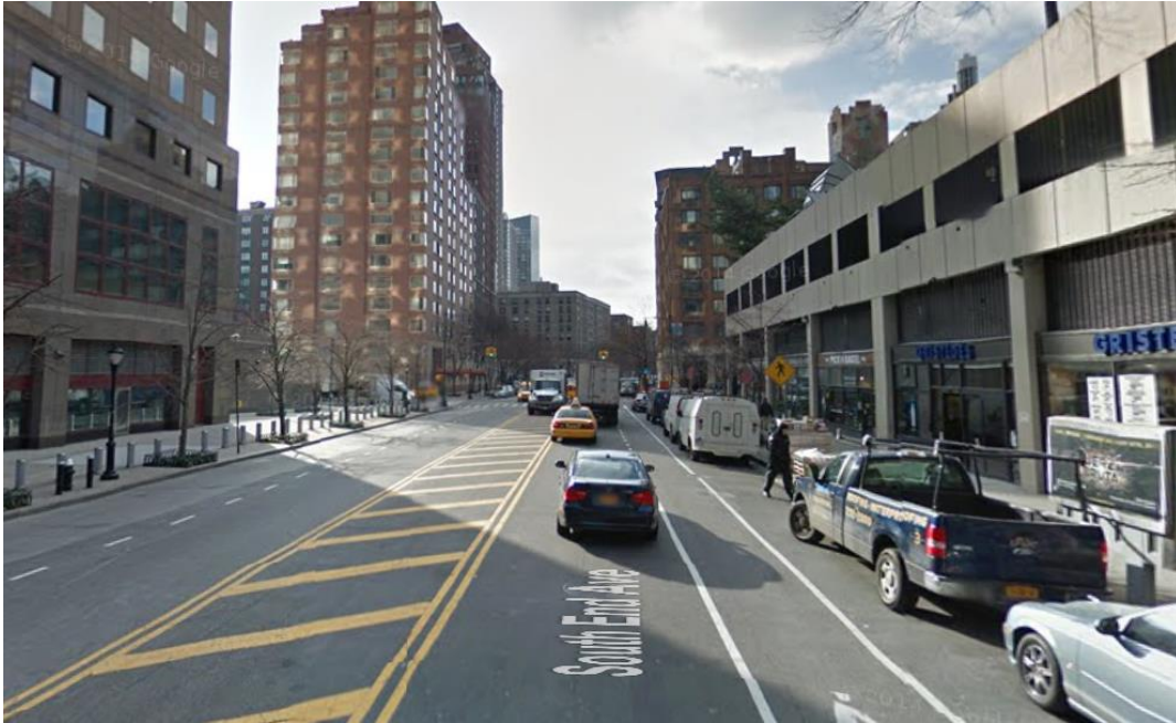
South End Avenue (facing south)