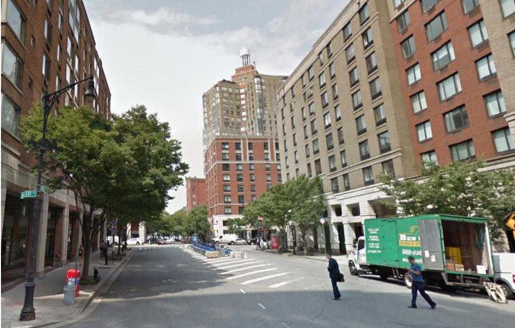
West Thames Street (facing west)