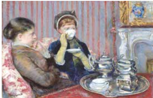
Five O'Clock Tea by Mary Cassatt

Everybody’s Irish on St. Paddy’s Day! Lads and lassies are invited to wear green and join friends and BPCA staff for tea and sweets on this cheery holiday.