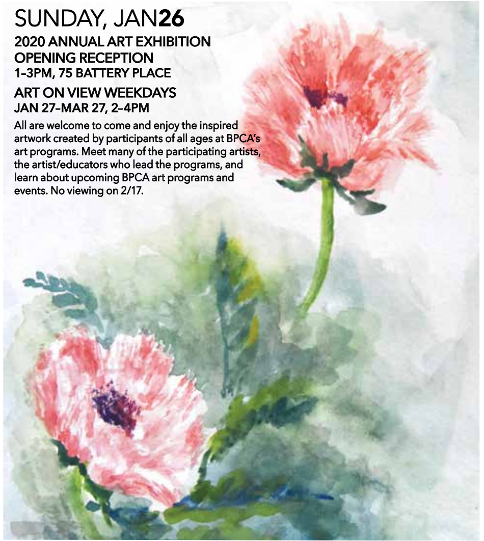
Watercolor by Florence Liu

All are welcome to come and enjoy the inspired artwork created by participants of all ages at BPCA's art programs. Meet many of the participating artists, the artist/educators who lead the programs, and learn about upcoming BPCA art programs and events. No viewing on 2/17.