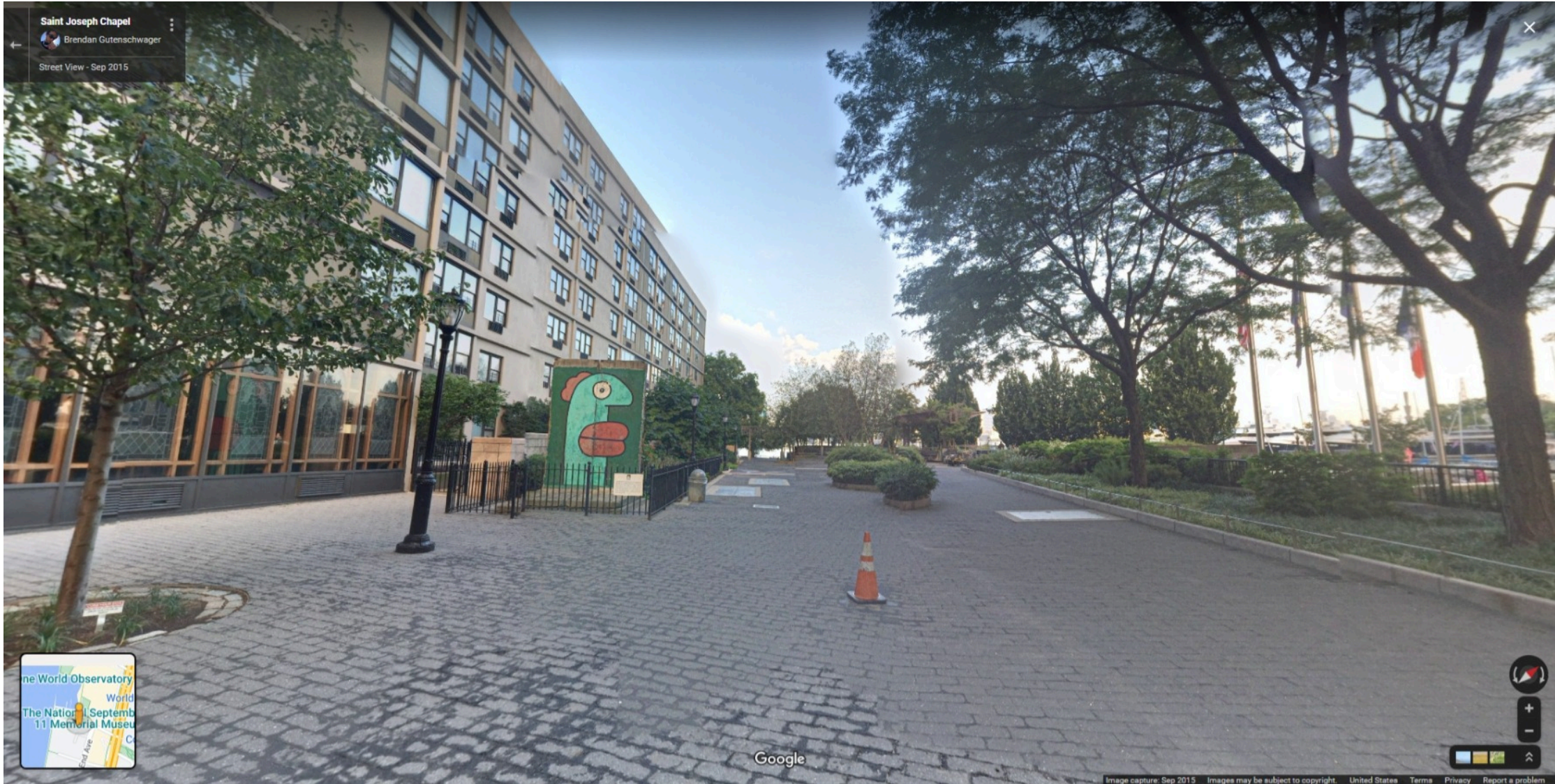
Berlin Wall Enclosure Procurement