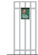
Sign Type F3 1/4" = 1'-0"