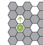
Sign Type H 1/4" = 1'-0"