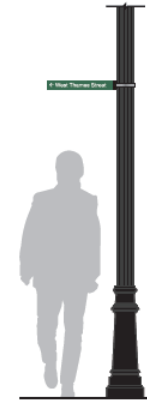
Sign Type C11 1/4" = 1'-0"