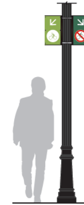
Sign Type C20 1/4" = 1'-0"