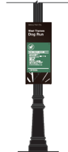
Sign Type E11 1/4" = 1'-0"