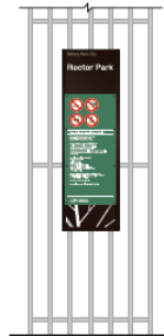
Sign Type E10 1/4" = 1'-0"