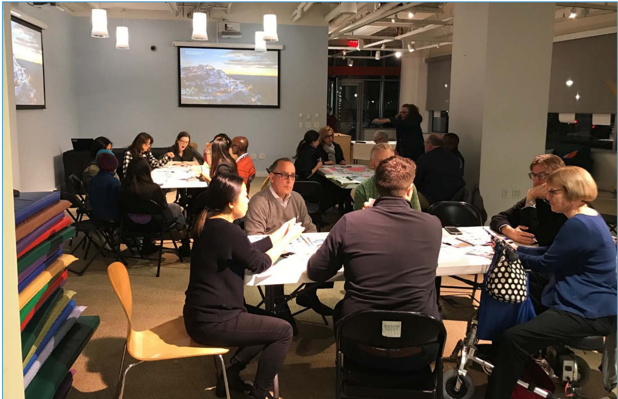
BUILT TO LAST: Energy and water consumption, open space, storm water management, transportation, air quality, and more were among the topics discussed at BPCA’s Sustainability Roundtable #3 on March 11.